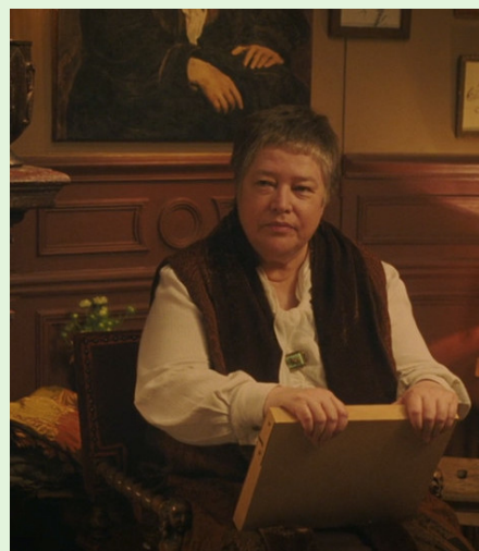
Kathy Bates as Gertrude Stein in Midnight in Paris , sitting in front of the portrait shown at left