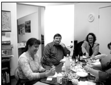
Classes at the AFSR, with giggles and Champagne

The AFSR is booming these days. There are tons of new Ateliers and courses. Check them out and sign up. The more the merrier! The school wants to be true to its commitment to excellence. In order to do so, we conducted a survey with the members, which we already mentioned last month. It appears that you want more classes, more time slots, a wider array of offerings. In order to do so, we need to