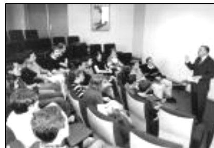
Classes with no time to express yourself.

We thank you for your understanding and hope that you will enjoy taking our wonderful classes: We want to do everything possible to make the school an even better place to be.